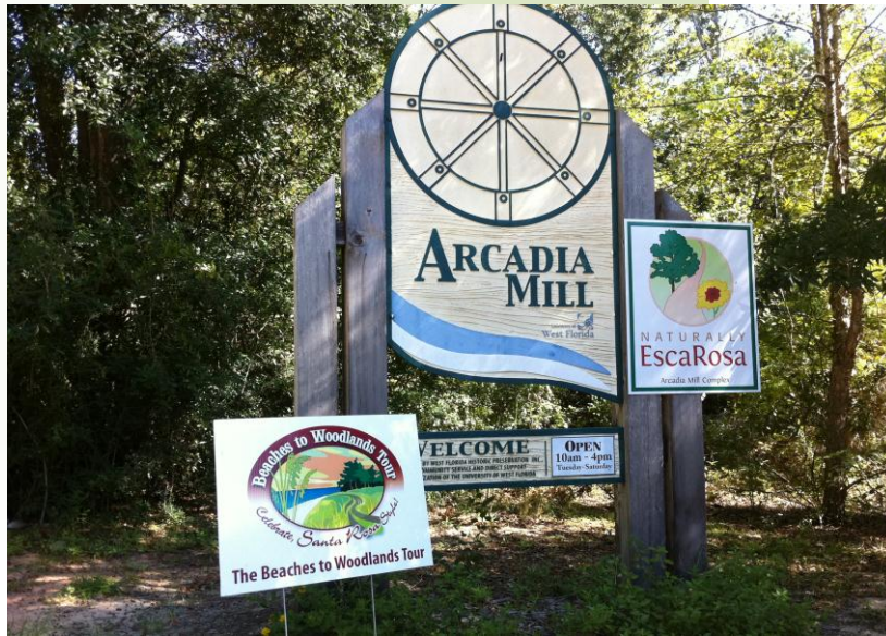
Join us for "Secrets of Santa Rosa: Archaeology and History in Your Backyard" at Arcadia Mill